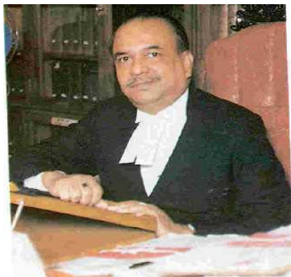
The Hon'ble Justice B P Singh BA Pol Sci Hons 1961 Hindu LLB 1963 Judge The Supreme Court of India 2001 – 2003