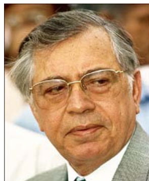
The Hon'ble Justice