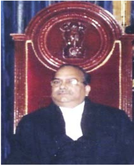
The Hon'ble Justice Ananga Kumar Patnaik BA Pol Sc Hons 1969 Judge The Supreme Court of India 2012 – 2014 Chief Justice High Court Chhattisgarh 2005 Chief Justice High Court Madhya Pradesh 2005 – 2009