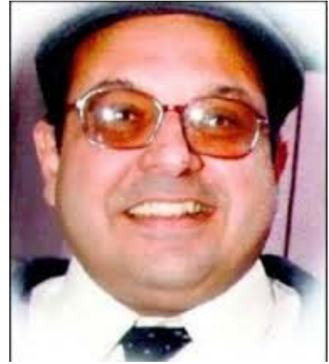
The Hon'ble Justice Rohinton Nariman BCom Hons SRCC LLB CLC Judge The Supreme Court of India since 2014 Solicitor General of India 2011 – 2013

... For much more of Alumni Info 'n Action click here <www.alumni.du.ac.in>