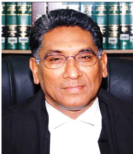
The Hon'ble Justice Vikramajit Sen BA His Hons St Stephen's LLB Judge The Supreme Court of India since 2012 Chief Justice Karnataka High Court 2011 – 2012