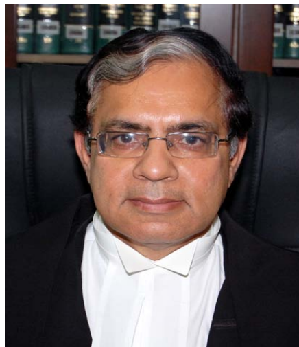
The Hon'ble Justice Arjan K Sikri BCom Hons 1974 SRCC LLB 1977 LLM 1980 Judge The Supreme Court of India since 2013 Chief Justice Punjab and Haryana High Court 2012 - 2013 Double Goldmedallist