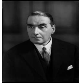
Sir Maurice Gwyer