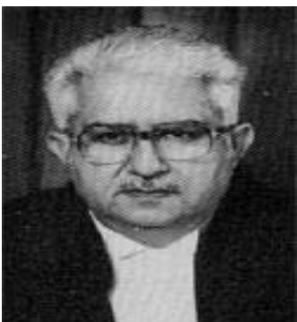
The Hon'ble Justice