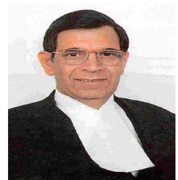
The Hon'ble Justice