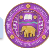
Illustration: There was a contract for the sale of 289 bales of goat skin. Every bale was to contain 5 dozens smaller bales and according to the contract the price was to be determined according to the price of smaller bales so that the seller was to count the number of smaller bales in every bigger bale. It was decided that no transfer of property has taken place when the bales were destroyed by the fire during the process of counting by the seller.

Transfer of property in unascertained goods: According to section 18 no transfer of property can take place from the seller to the buyer in unascertained goods. Therefore some acts have got to be done in order to convert unascertained goods into ascertained or specific goods. Such acts are collectively and technically called 'appropriation'. According to Section 23 "Where there is a contract for the sale of unascertained or future goods by description and goods of that description as well as in deliverable state are unconditionally appropriated to the contract, either by the seller with the consent of the buyer or by the buyer with the consent of the seller, the property in the goods shall be transferred from the seller to the buyer, as soon as such appropriation is made, the consent of the buyer or the seller as the case may be obtained either before or after appropriation.